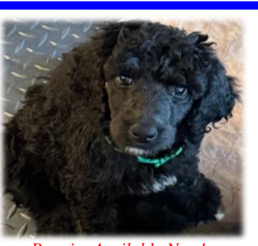
Puppies Available Now!