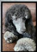
Tessa 13 months

and Friends, LLC Sophisticated Standard Poodles